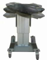
LATERAL TILT CFPM400