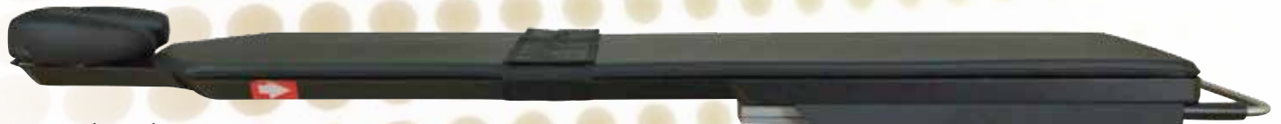
Integrated Headrest Top