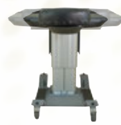
LATERAL TRAVEL CFPM401